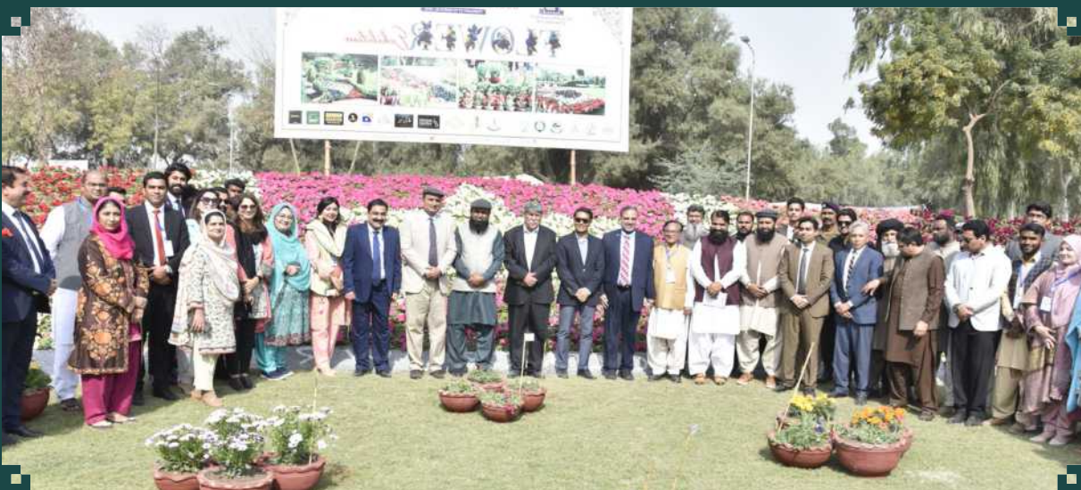
3 rd Bahawalpur Literary and Cultural Festival (BLCF-2023)