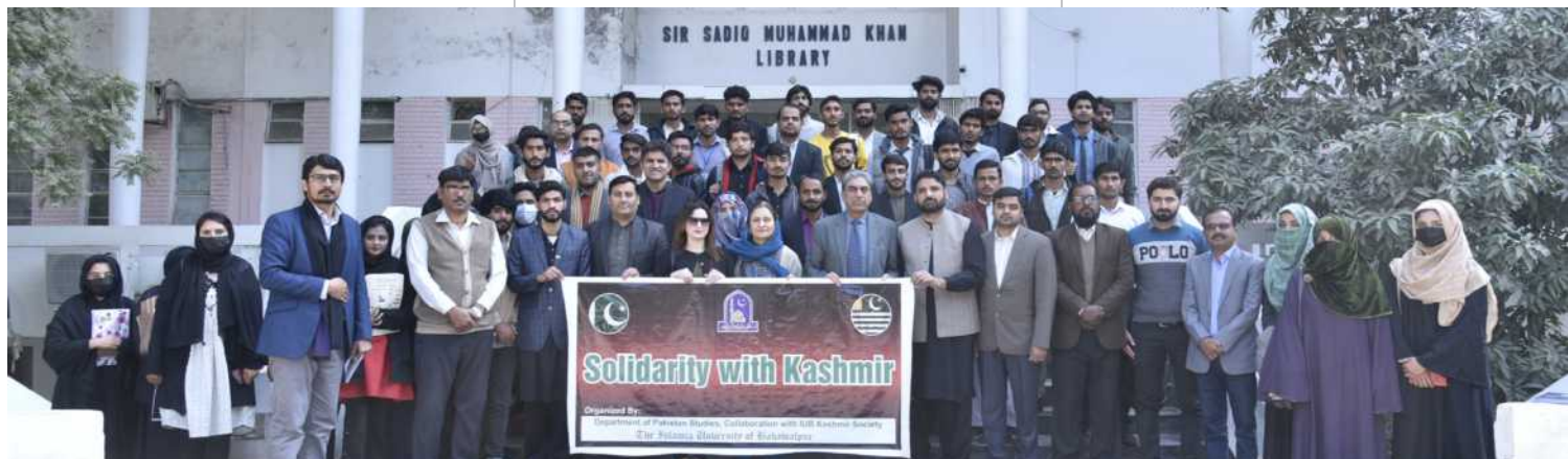
Participants of the walk on Kashmir solidarity day