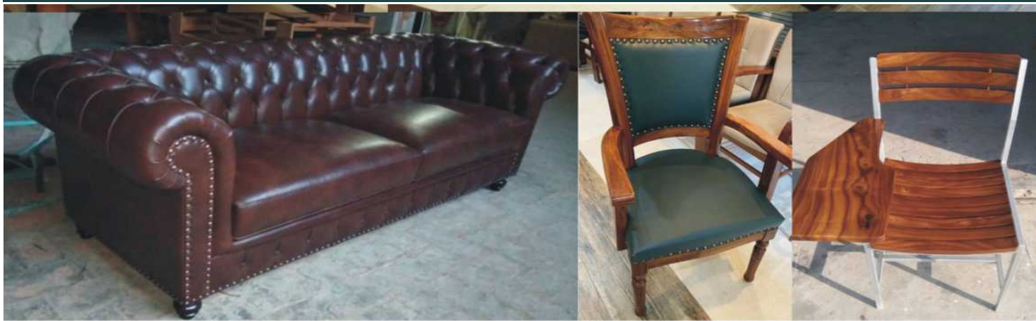
A view of Ready Furniture