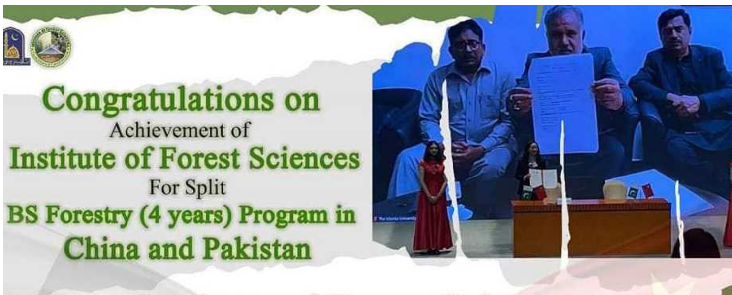
View of MoU signing Between IUB and Yunnan Forestry Technology China and Tang China Education and Technology Limited