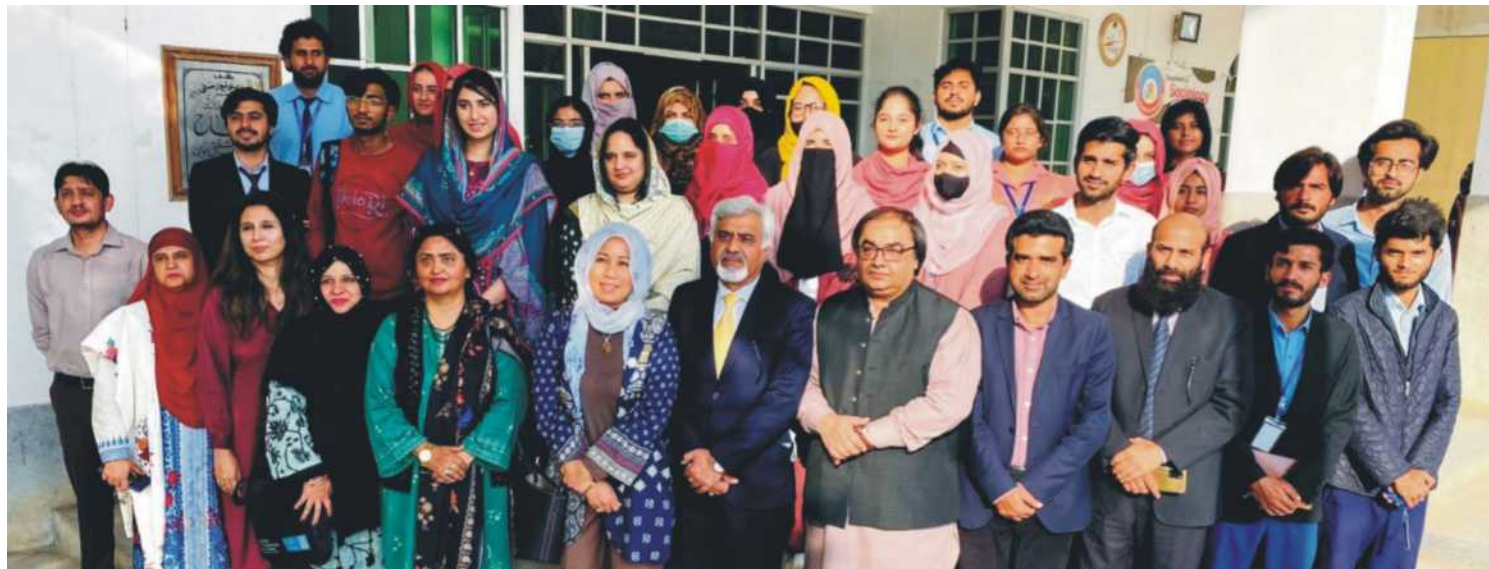
Participants of the seminar