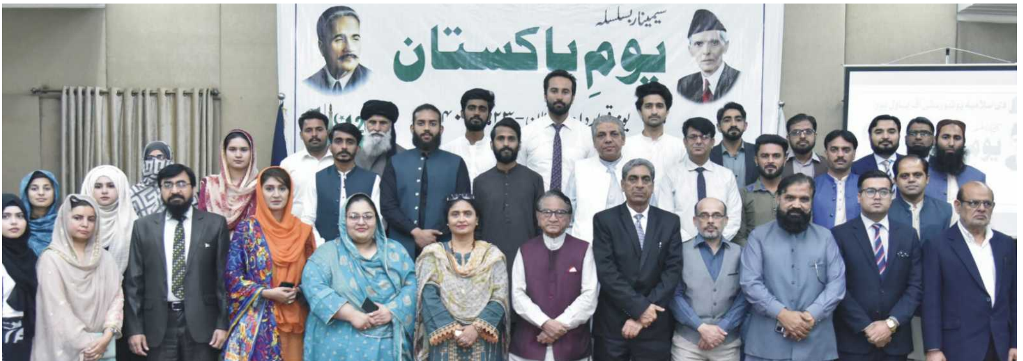
Participants of the seminar

give freedom to the subcontinent but they did not want to give a separate state to the Muslims, but the Muslims of the subcontinent got Pakistan with their blood and the blood of martyrs by making eternal sacrifices. They can make their own