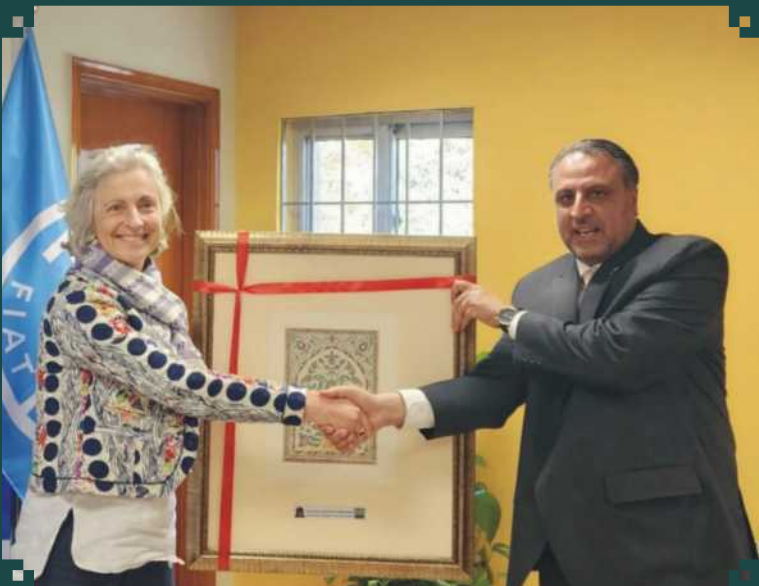
Vice Chancellor visits the United Nations Food and Agriculture Organization's (FAO) office