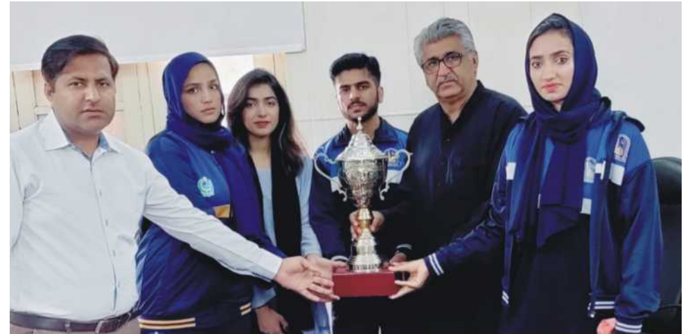
IUB Students receiving the winning trophy in Baseball and Taekwondo in Pakistan inter University Sports gala at Sargodha University