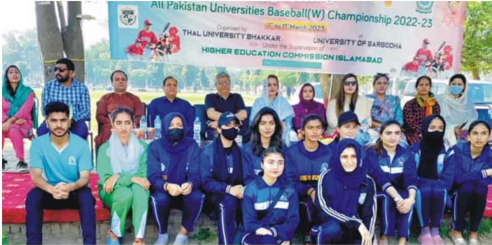
Women Teams in Baseball and Taekwondo in Pakistan inter University Sports gala at Sargodha University