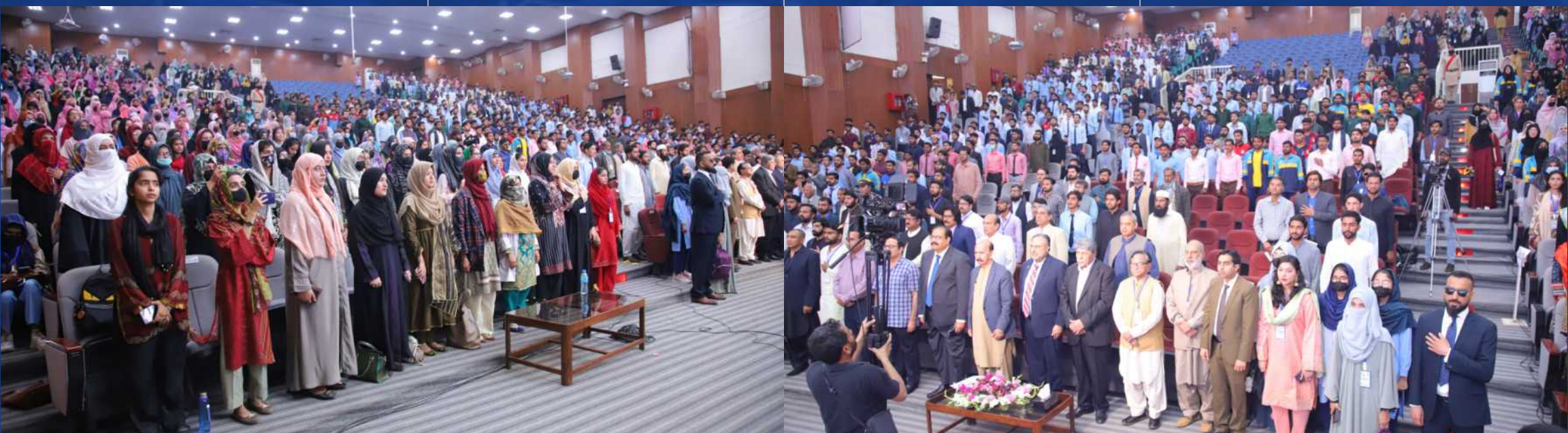
A view of inaugural ceremony