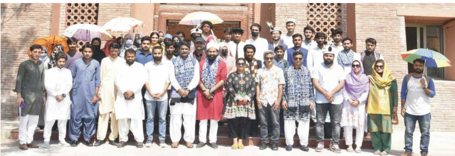
District Administration of Bahawalpur and IUB celebrating Punjab Cultural Day