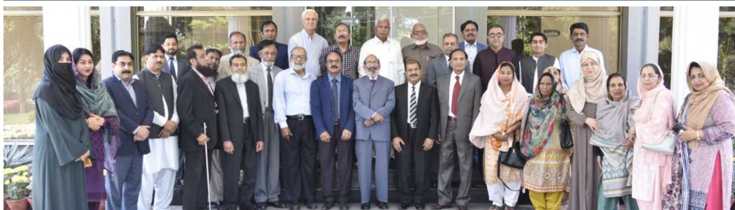
Alumni batch of 1976 visits their Alma Mater, the IUB