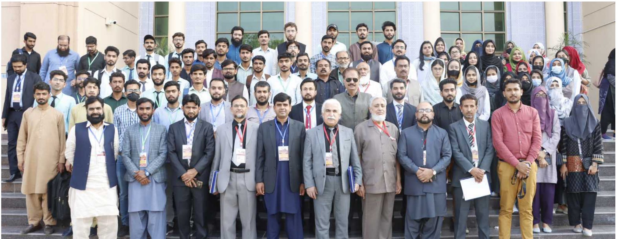
Group photo of participants

students of the Islamia University of Bahawalpur participated in the conference.