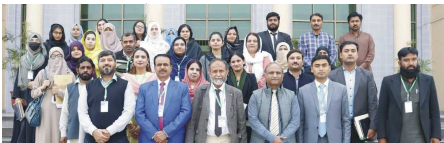
Group Photo of the Participants of the workshop