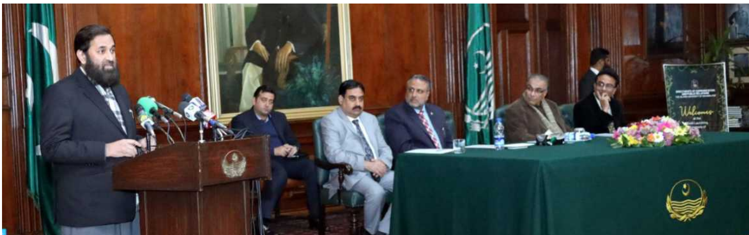
Governor of Punjab, Engr. Muhammad Baligh-ur-Rehman addressing the ceremony