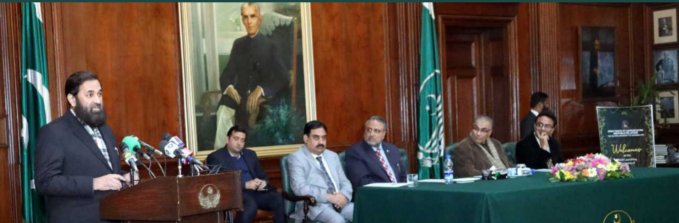
"22 Log" Book Launching Ceremony at the Governor House Lahore