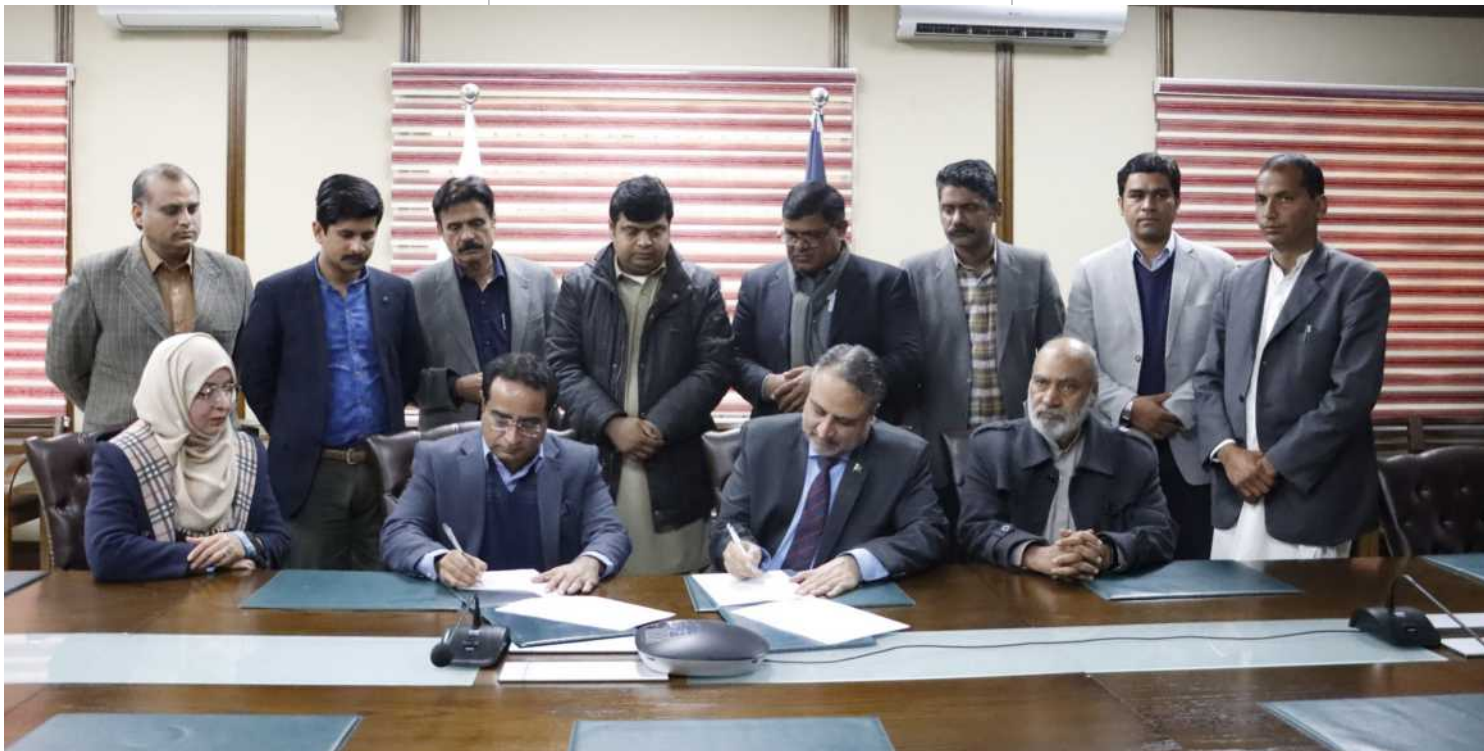
A view of MoU signing Ceremony