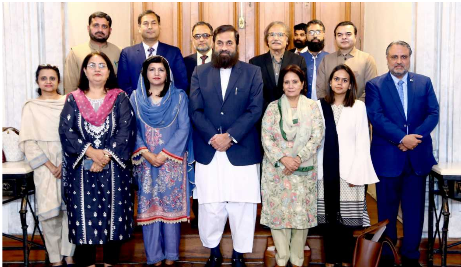
Group photo of Vice Chancellors from various Universities with Honourable Governor Punjab Muhammad Baligh-ur-Rehman who participated on Character Building Consortium at Governor House Lahore

research in the next meeting. He said that a plan of action will be decided in the light of the recommendations suggested by the consortium formed on character building in the next meeting. Governor Punjab Muhammad Baligh ur Rehman asked the consortium members to tell the students case studies of people who have achieved success in the society through hard work and merit. He said to mobilize the students for public awareness campaign on social media regarding character building. Governor Punjab further said that tell the students that there is eternal success in the truth and tell them not to believe what they hear on social media and do not spread it without research but do your own research. On this occasion, the consortium members made other suggestions including making community work mandatory for character building of students, using social media in character building.