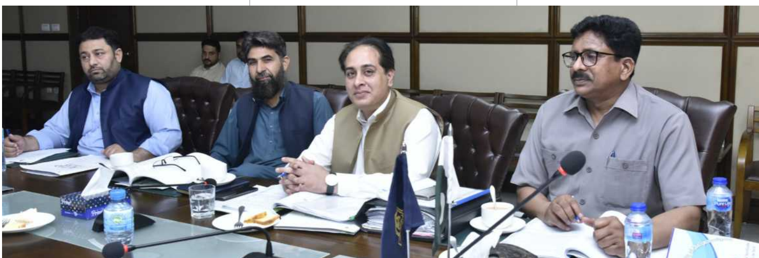
A view of meeting