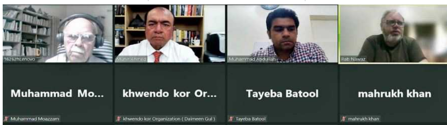
A view of Webinar

provides employment to about 10 million people. It contributes about one percent to national GDP and 4 percent of Agriculture GDP. He said Marine biodiversity of Pakistan is being threatened by uncontrolled commercial fishing operations in coastal and offshore waters using some of the deleterious fishing gears and undesirable practices. Trawling for fish and shrimp and use of gillnets are most dangerous fishing gear which has led to destruction of habitat for fishes and shellfishes and marred with bycatch of some endangered, threatened and protected species including turtles, sharks and dolphins. Increased pollution from the metropolis of Karachi has led to elimination of marine life around some areas of Karachi. Dumping of about 400 million gallons of untreated sewage, both industrial and domestic, in the ocean is one of the threats which