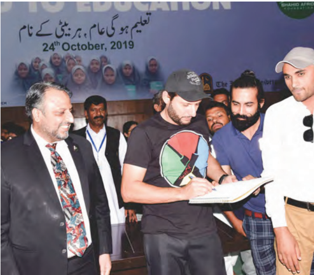
Glimpses of Shahid Khan Afridi's visit to IUB