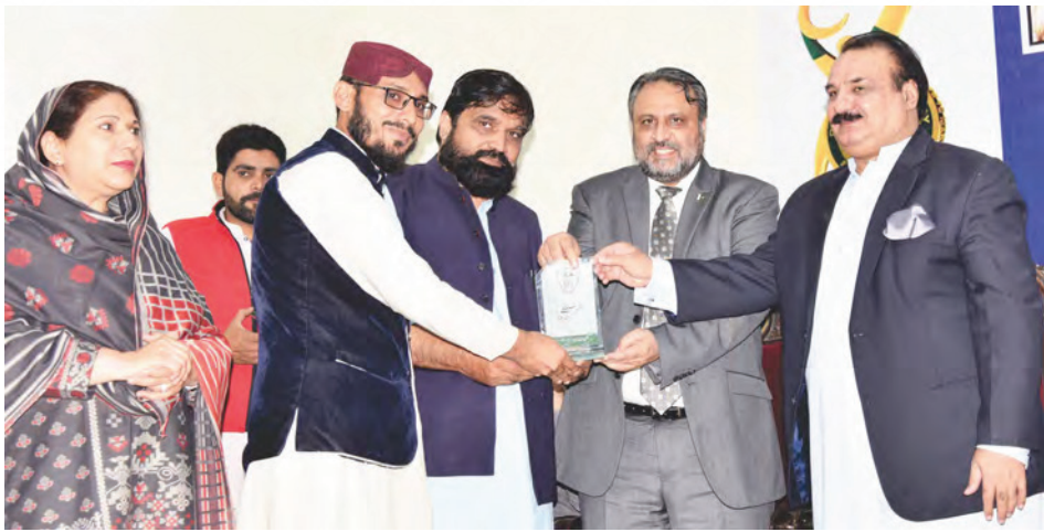
A view of MoU signing Ceremony