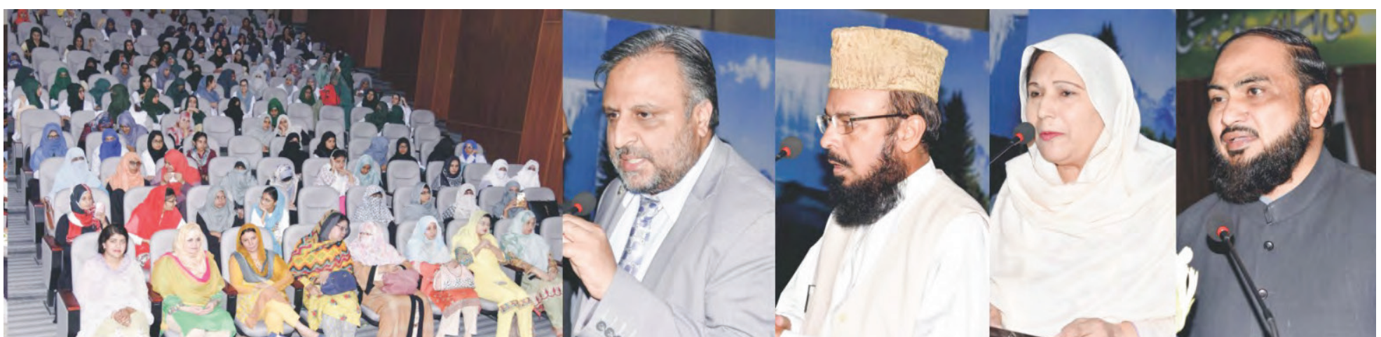
Seerat ul Nabi ﷺ Seminar organized by Arabic Department