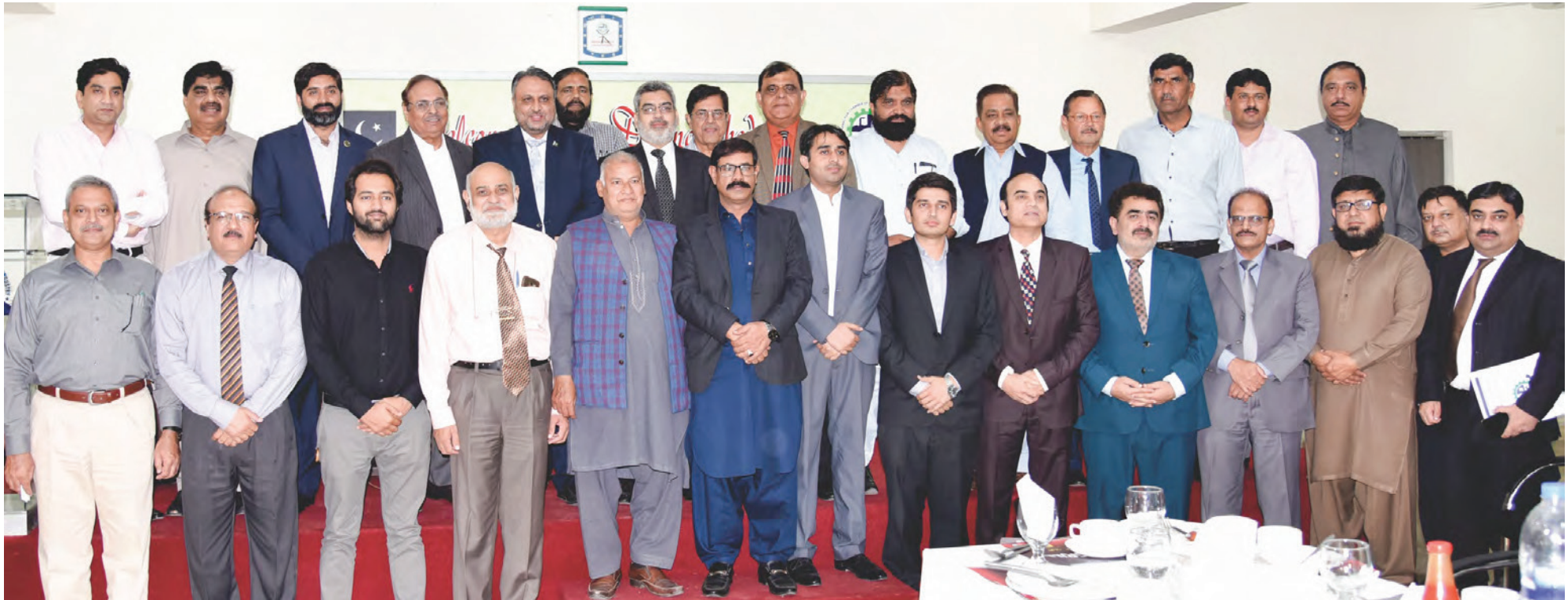
IUB faculty members and office bearers of BCCI during the MoU ceremony