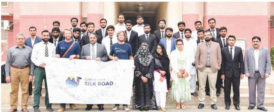
Tourists from Austria visited Bahawalpur

The present government is promoting tourism in the country and the Islamia University of Bahawalpur will play it's due role in promotion of tourism in Southern Punjab. The Vice Chancellor said this during a meeting with two Austrian tourists visiting Pakistan on the theme of highlighting ancient silk route connecting Europe and