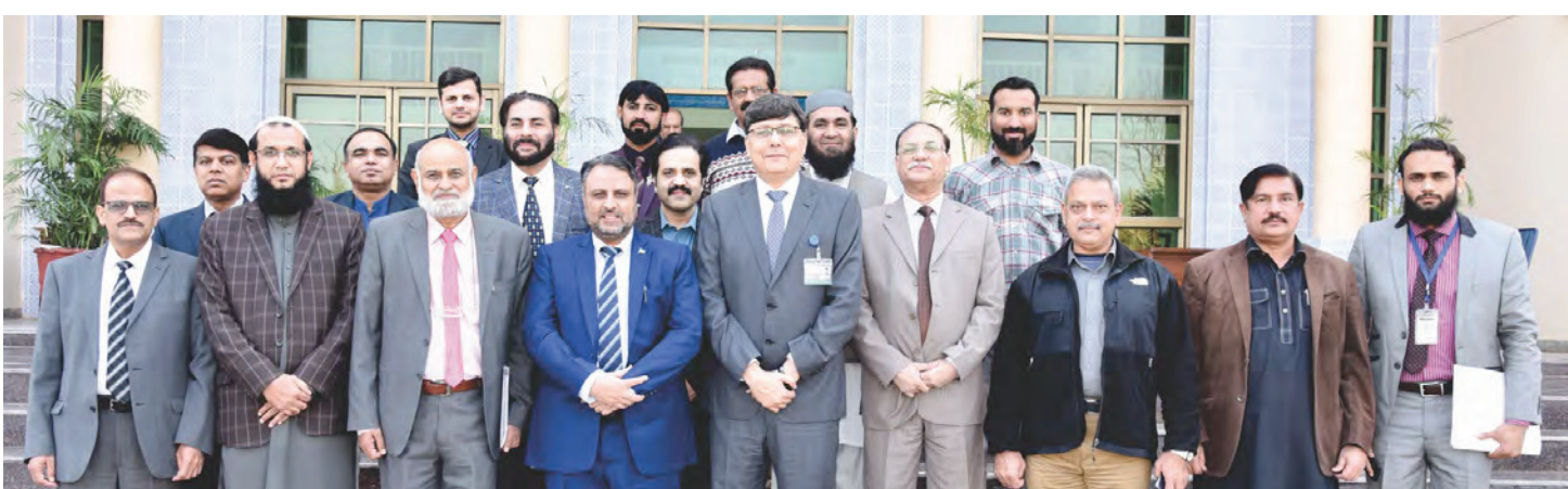
Participants of Hepatitis awareness seminar

department of the Punjab on direction of Honourable Chief Minister Punjab has made large scale arrangements at the University to smoothly facilitate thousands of students and employees. The Vice Chancellor also apprised that a vaccination center will be setup in the University with the support of District Health Authority Bahawalpur for treatment of Hepatitis patients. Meanwhile, the Islamia University of Bahawalpur and Hepatitis and Infection Control Program Primary and Secondary Health Care Department, Govt. of the Punjab agreed to establish a Hepatitis Clinic at the University Campus. This clinic aimed at declaring the Islamia University of Bahawalpur as Hepatitis free university, establishment of Hepatitis Clinic and Sentinel