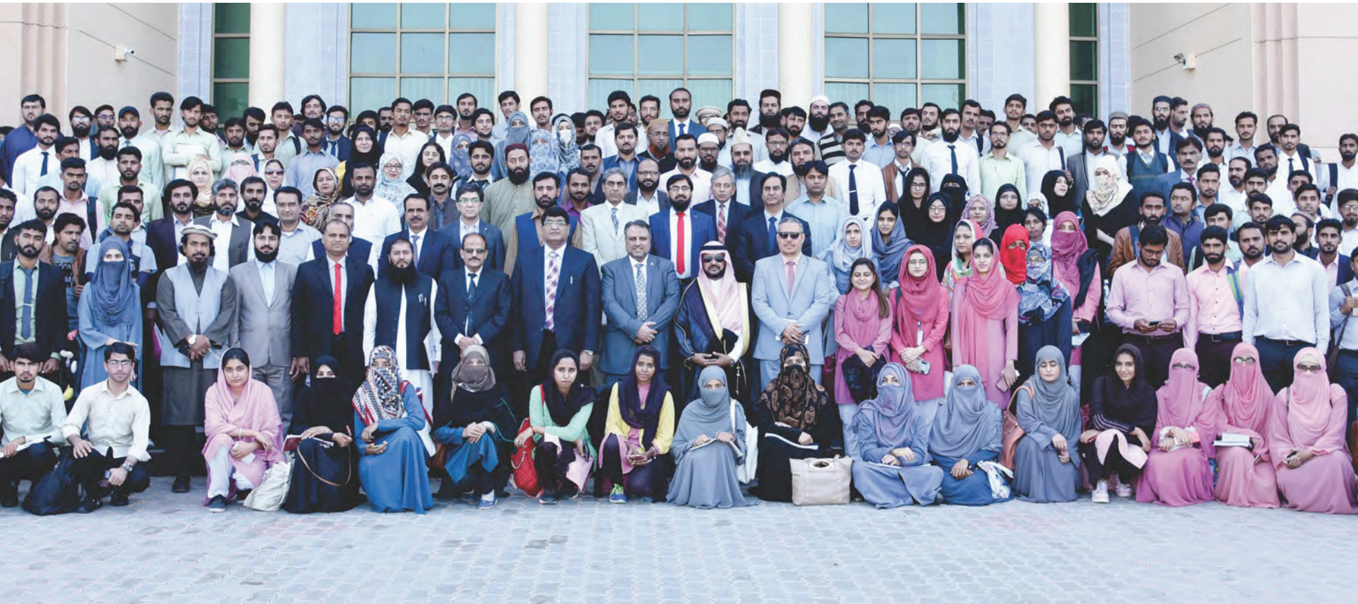
Group Photo of Seerat ul Nabi ﷺ and Paigham e Pakistan Seminar