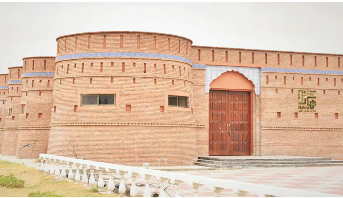
A view of Hakra art gallery