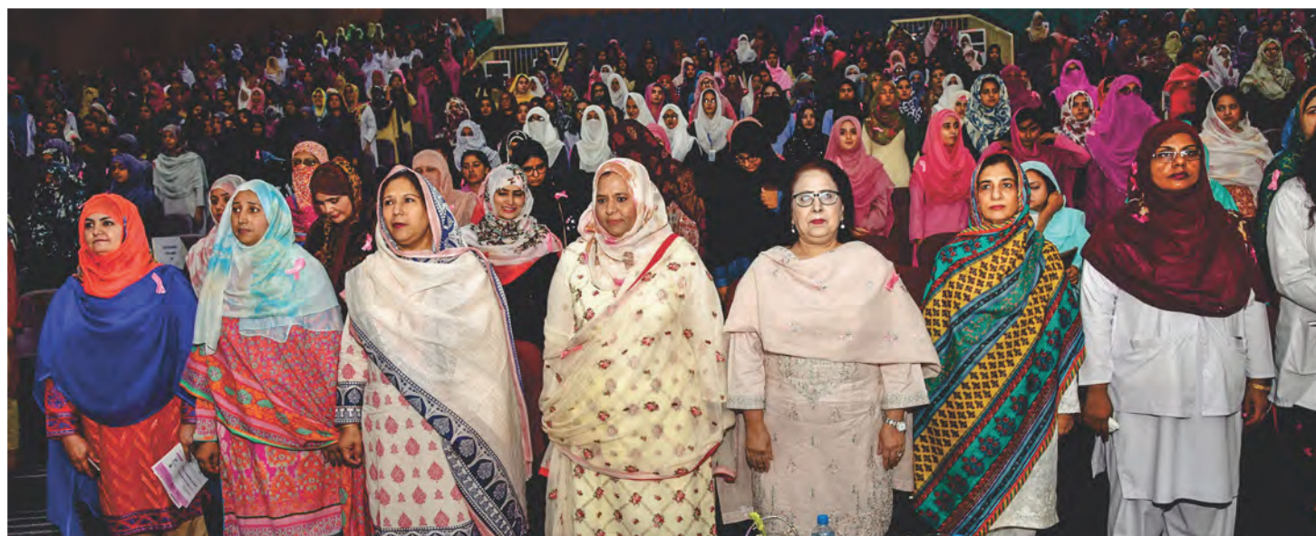
Participants of awareness seminar on breast cancer at the Islamia University of Bahawalpur