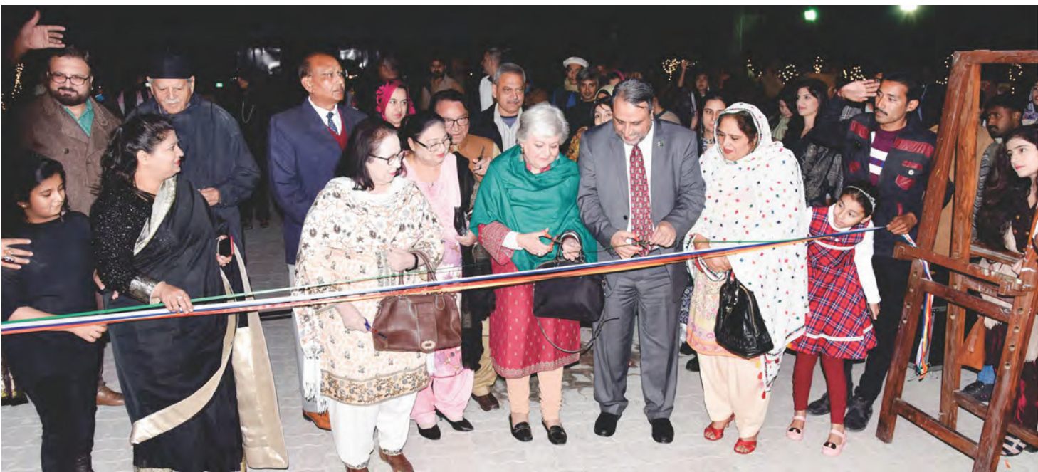
Inauguration of Annual Art Exhibition