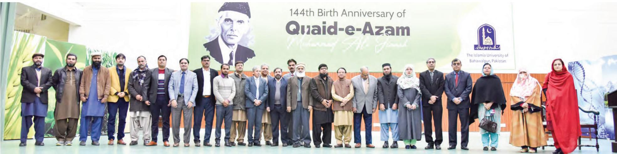
Participants of Quaid e Azam Seminar