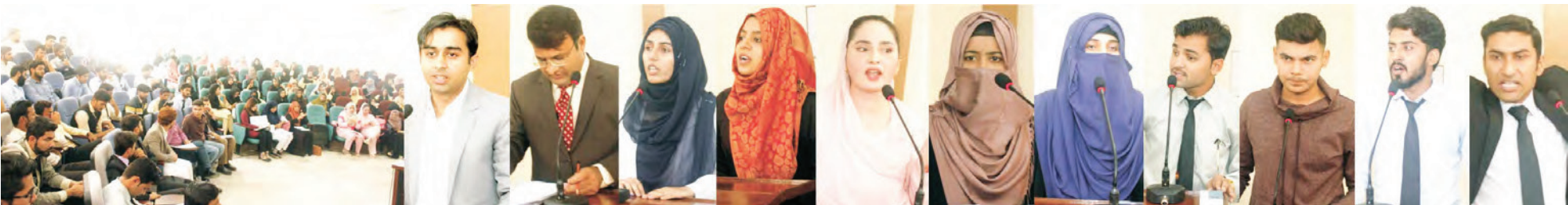
Speakers of a seminar organized by Character Building Society