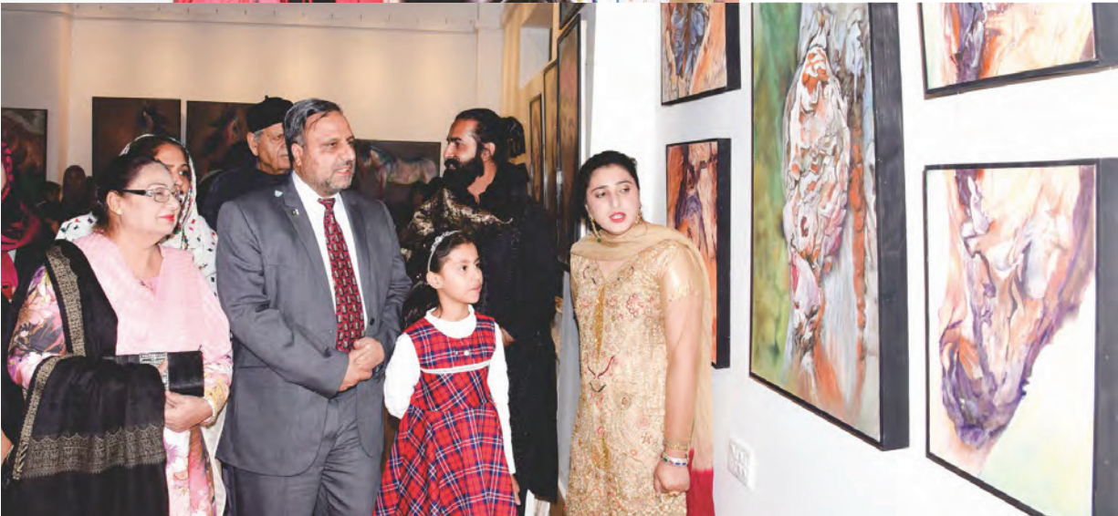
Glimpses of Art Exhibition