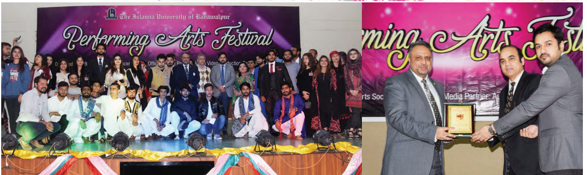
Glimpses of Performing Arts Festival