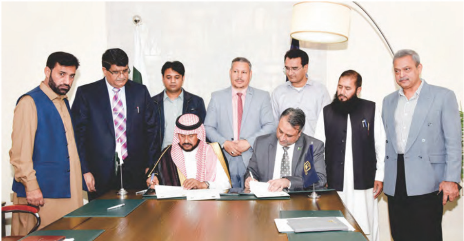
Vice Chancellor IUB and President IIU signing the MoU