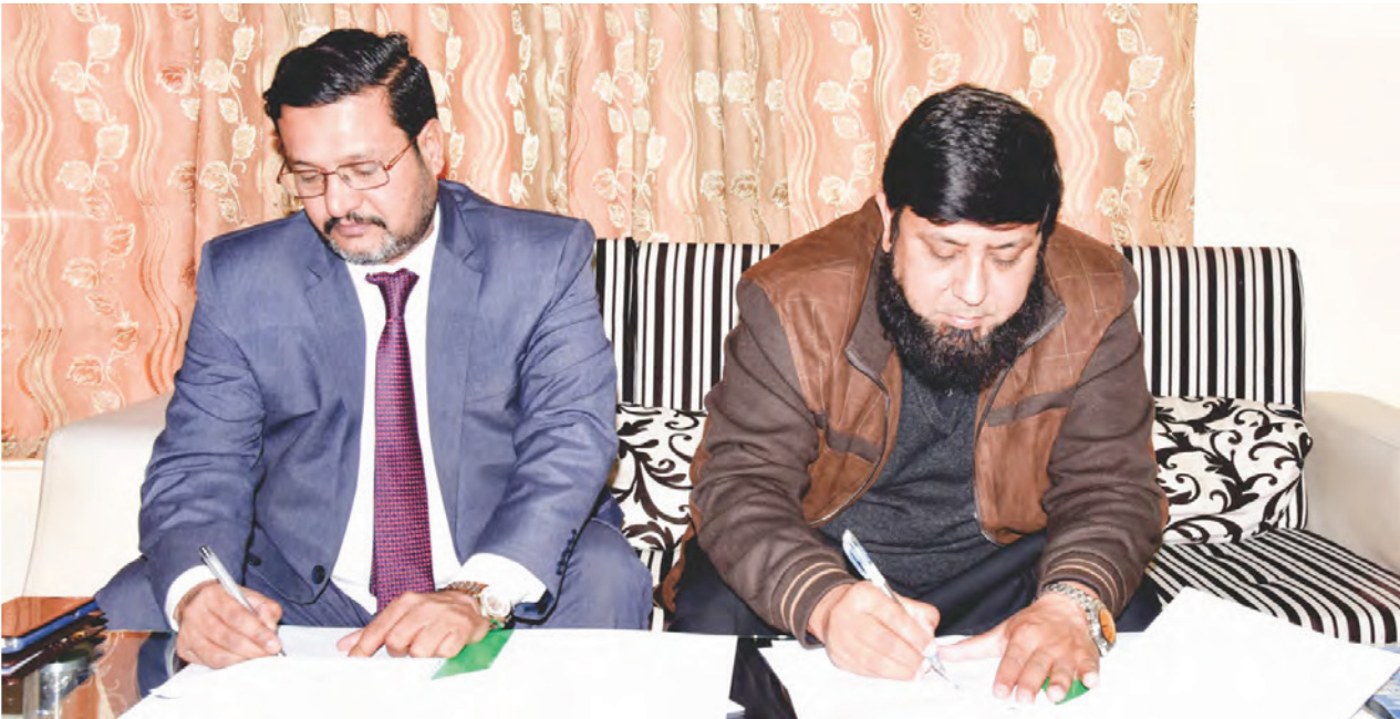
Dean Management Sciences IUB and Vice Chancellor CUST signing the MoU