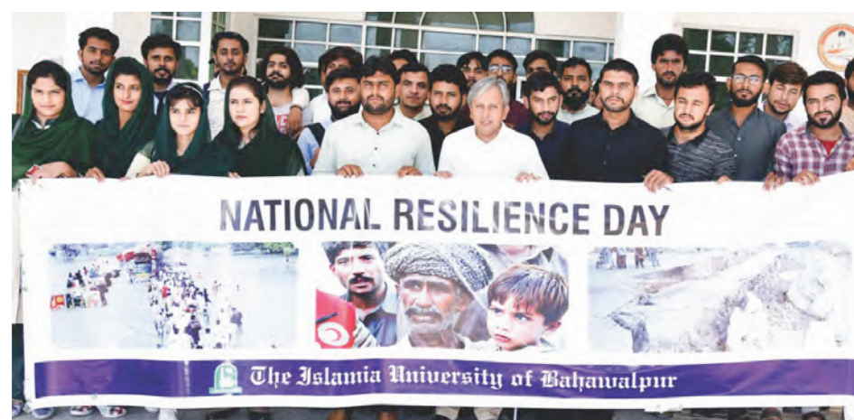
Participants of awareness walk

natural calamities in professional manner. He said in his message that this day reminds us the horrific catastrophe of earthquake of 8 October 2005 when the whole nation united to fight this disaster. At a seminar held at Department of Social Work the participants said that it is duty of youth to voluntarily participate in trainings of disaster management and raise awareness in this regard.