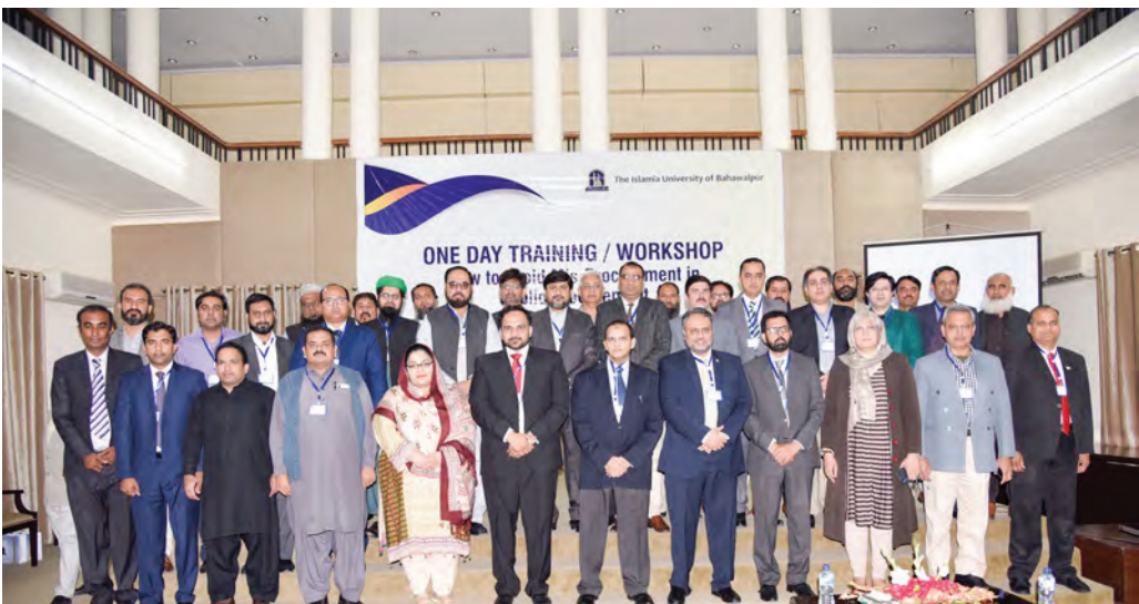
Participants of training workshop

understanding of public sector procurement, providing an overview of such areas as the legislative environment, the processes, rules and documentation. This training empowered delegates to be better equipped to engage with public sector organizations. The course focused upon the creation of efficient and effective tendering strategy including completion of pre-qualification questionnaires, invitation to tender documentation and evaluation methodologies under PPRA. Participants of this training program learned some of the key control issues in dealing with government resources and financial controls place to